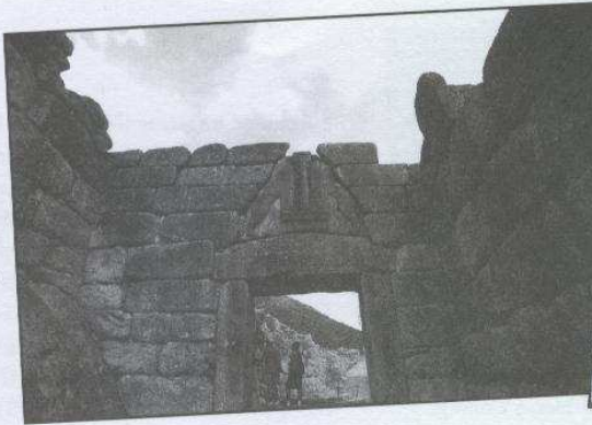
The Lion Gate at Mycenae.