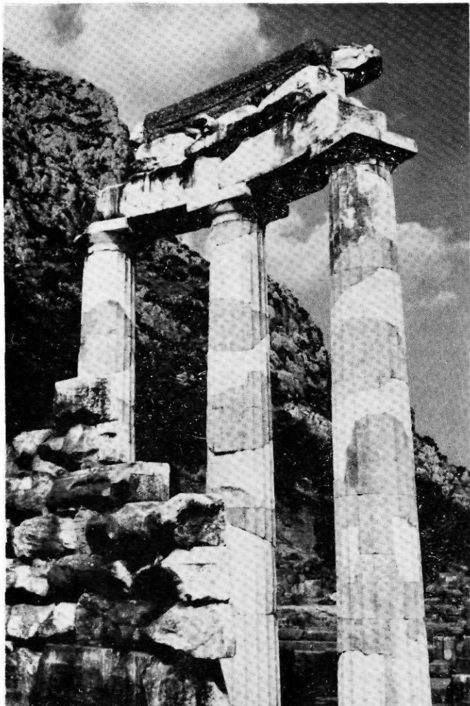
The Tholos or Rotunda in Delphi, a graceful Doric building of the early fourth century, is made of Pentelic marble.