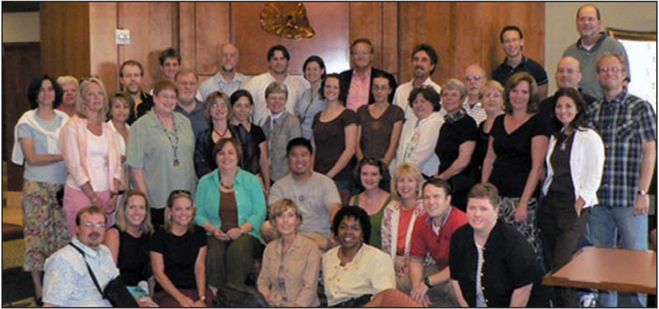
Participants in the 2006 North American Cambridge Classics Project Summer Workshop in Atlanta, Georgia.

However, after attending the summer workshop with nearly fifty other Latin teachers across the country on July 5-8 in Atlanta, Georgia, I am now much more confident with what I am doing in my classroom. On the first day of the workshop, we learned about the differences between the traditional grammar-based approaches to teaching Latin and compared it to the CLC reading-based approach; it was this discussion and lesson about the differences between the two methodologies that convinced me that the reading-based approach is clearly the best option for my students.