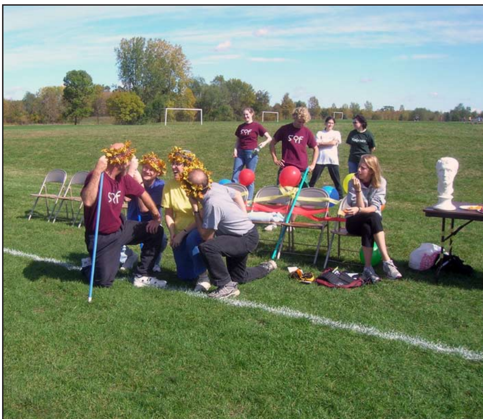
Judges conferring at the First Annual St. Olaf Olympics co-sponsored by the Society for Ancient History and the Delta Chi chapter of Eta Sigma Phi on September 30, 2006. For more images, see http://www.stolaf.edu/depts/classics/classics_honor_society/delta_chi_current_events.html