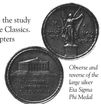
Obverse and reverse of the large silver Eta Sigma Phi Medal