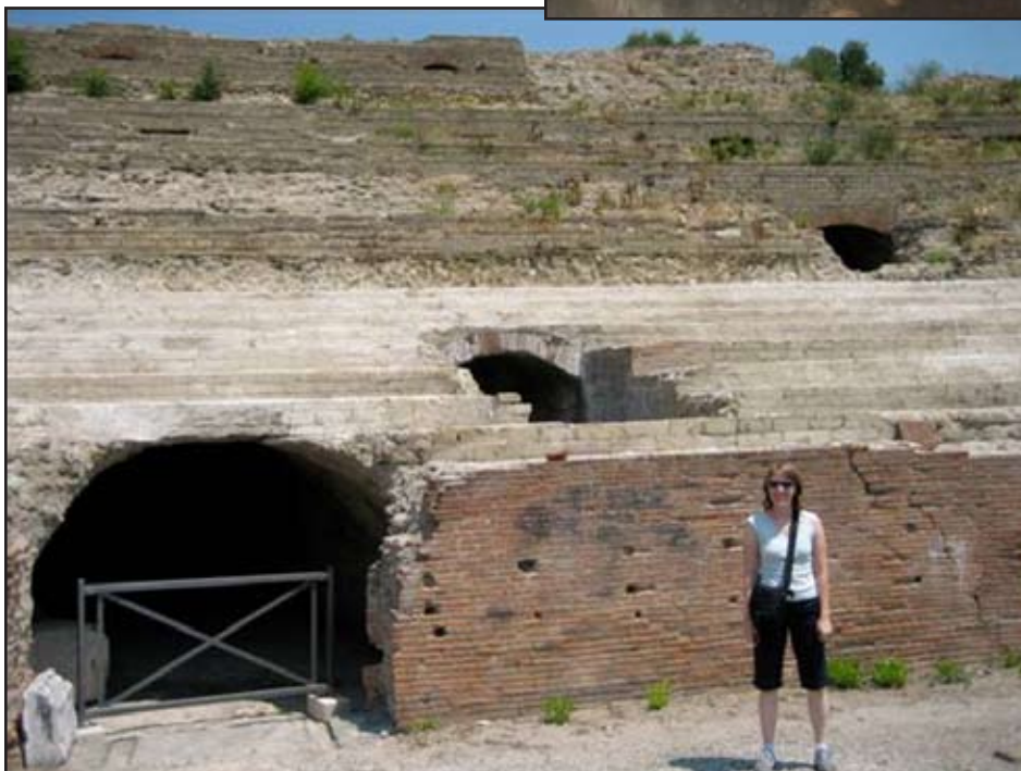
In the theatre at Pozzuoli