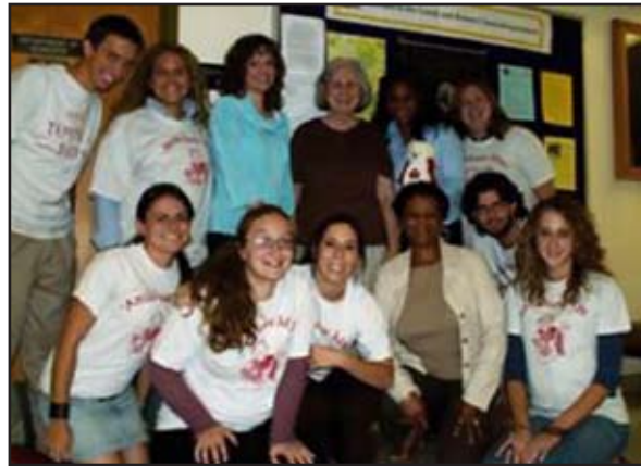
Members of Zeta Beta Chapter at Temple University

at the invitation of Zeta Beta Chapter at Temple University