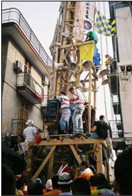
Giglio on a street in Nola

the curious “Temple of Romulus” on the Roman Forum. Despite its location on the most visited square in Rome, the church was usually empty and quiet whenever I slipped through its ponderous doors to admire this choicest cut of the art of Late Antiquity. The number and arrangement of the figures in the mosaic suggest the complexities of Roman patronage, and a small phoenix perched atop a palm-tree awakens ancient hopes of rebirth. Christ