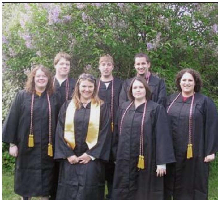
Members of the 2006 class of Gamma Omicron Chapter at Monmouth College wearing their Eta Sigma Phi cords and hoods.

Cords are $15 each by mail and $12 each if purchased at the national convention. Hoods are $20 each by mail and $17 each if purchased at the national convention.