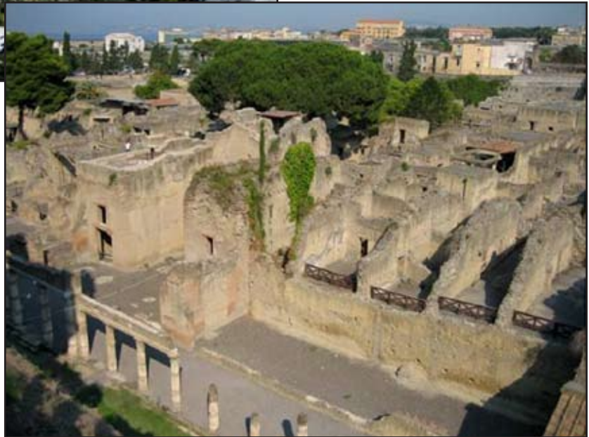
Below, excavations at Herculaneum

because I had recently taught Book 6 of the Aeneid , in which Aeneas describes his journey to Cumae, the Sybil's cave and the Underworld. The Sybil's cave, dating back to the 5th century BCE, was remarkable. I had the honor of playing "Sybil" and reading the prophecy from Aeneid 6.82-97. It was everything I hoped it would be.