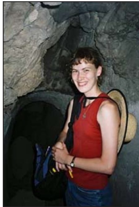
Kiehl tunneling in the Aqua Claudia

in a town of comparatively small import. As we pieced together a plan of the town, however, we realized that we had seen the standard features that identified a town as Roman emerge at a range closer than was permissible at many sites. We also learned to sympathize with the “first responders” who try to interpret a freshly-excavated site! Herculaneum is another site often overlooked by the tourist (and scholar) hordes who rush to the big-name sites, but it, too, offers rich rewards that the main destinations do not: the second story of Roman buildings, carbonized wooden doors and beams, and houses beaming with preserved wall-painting. The Hall of the Augustales combined these elements, I would venture, to outdo any building that I was allowed to see in Pompeii.