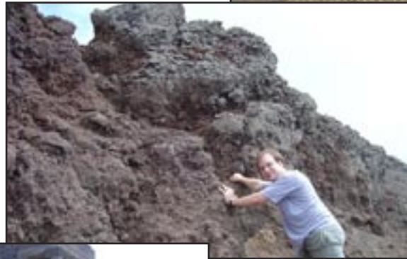
Left, climbing Vesuvius