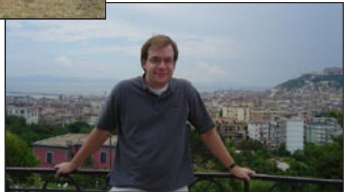
Right, overlooking Naples

into the way the Romans lived during this period. Herculaneum is also the site of the Villa of the Papyri, so called because it contained an extensive library, including several works by the once lost Epicurean writer Philodemus. Pompeii as well provided me with a unique look into the day-to-day lives of the Romans. At both Herculaneum and Pompeii, we visited the places the Romans would have visited at the time, exploring the baths, temples, the forum, the amphitheater, and the tav-