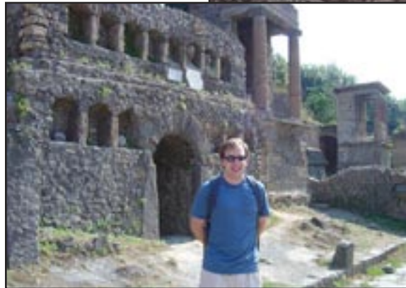
Bottom, at a tomb outside Pompeii