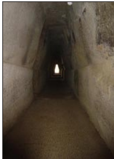
In the cave of the Sibyl