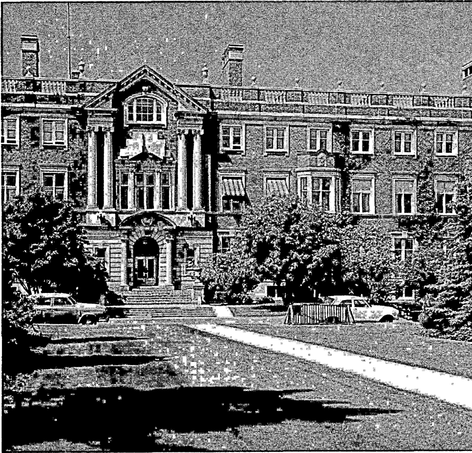
Building of the Faculty of Arts, University of Alberta