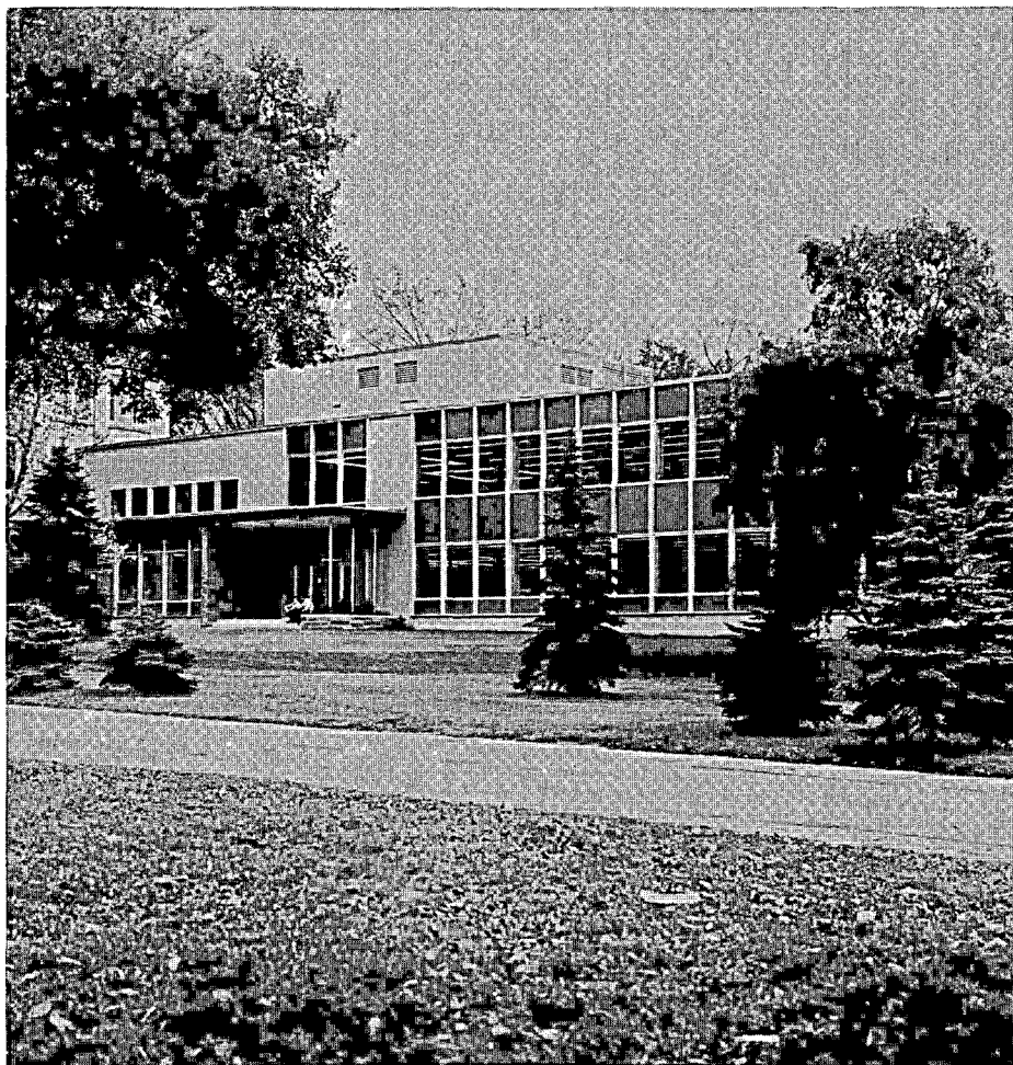
Library, Canisius College