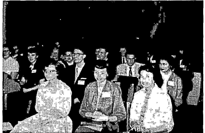
A business meeting.

with the schools and make the scholarship available as soon as possible. This will possibly require a year or more.