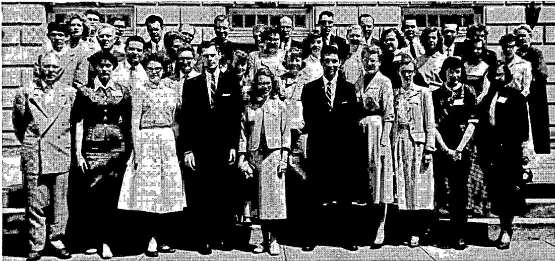
AT LEFT is shown a picture made of the group during the convention.