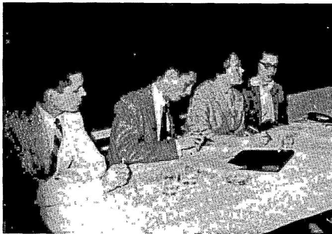
The officers during a business session.