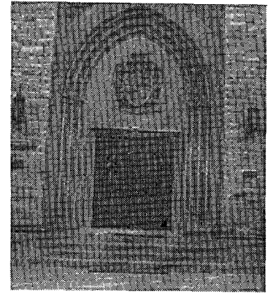
LAVERE MEMORIAL TEMPLE, NORTHWESTERN UNIVERSITY.