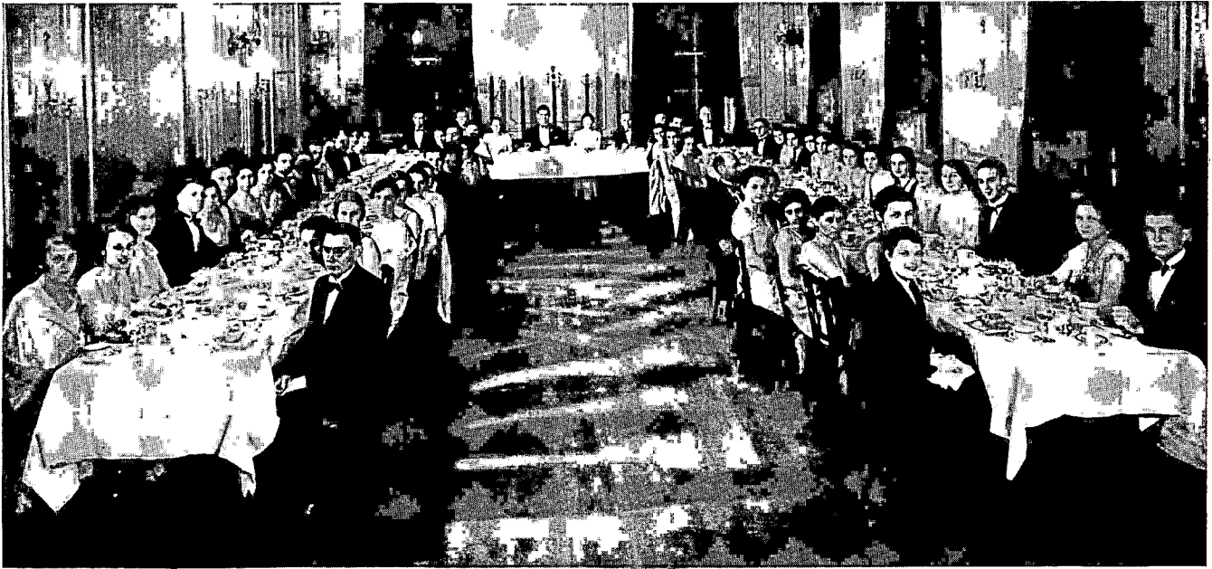
BANQUET SCENE AT THE ANDREW JACKSON HOTEL

Committee. The following people were nominated and elected as officers for 1932-1933: