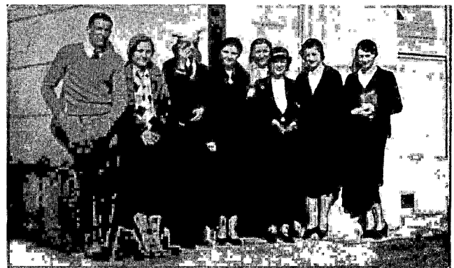
ZETA AND GAMMA ENROUTE TO NASHVILLE

Another business session followed the lecture, in which the reports of the Megas Chrysophylax, the Megas