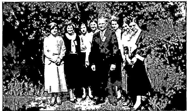
GAMMA IN THE GARDEN OF THE HERMITAGE