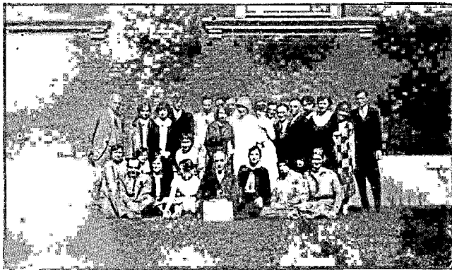
DELEGATES TO FIRST NATIONAL CONVENTION

One advantage of the conventions is that they give the delegates an opportunity to hear and to become acquainted with some of our important classical scholars. The names of the speakers whom we have been privileged to hear at these conventions will show the wealth of opportunity which the delegates have had of hearing the best that is being thought and written by leading classical scholars in various fields. Among others there have been Professors