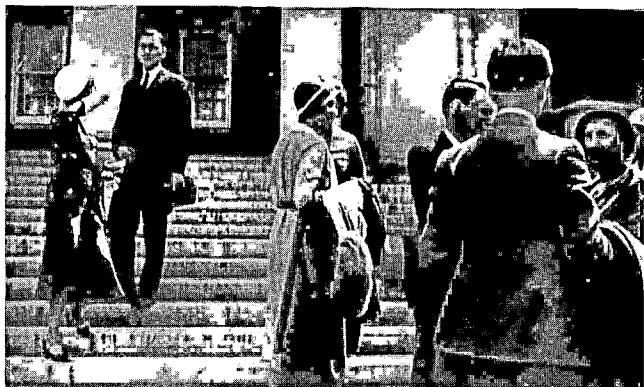
DELEGATES OFF DUTY

The business session Saturday morning began at 8:30