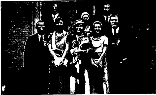
NATIONAL OFFICERS OF 1931-1932

AFTER MONTHS of anticipation fifty-three members of Eta Sigma Phi arrived in Nashville for the Eighth Annual Convention, April 20 and 30. Altogether twenty-three chapters were represented. The trip through the beautiful country and the cordial welcome of Psi