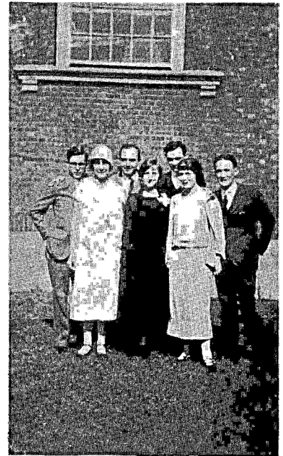
FIRST NATIONAL OFFICERS OF ETA SIGMA PHI