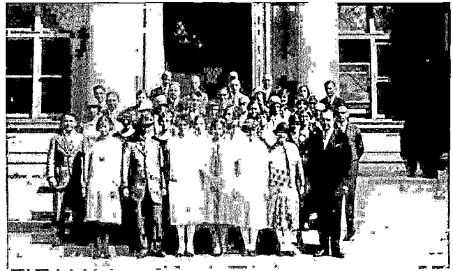
DELEGATES TO SECOND NATIONAL CONVENTION

When the conventions have met in large cities our hosts have regularly provided us with means of becoming