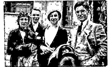
PI AND OMICRON DELEGATES

laboratory without that personal contact. I have the feeling that in our study of the classics we get closer to what I have called the springs of life and learning than we do in any other discipline in the universities, and