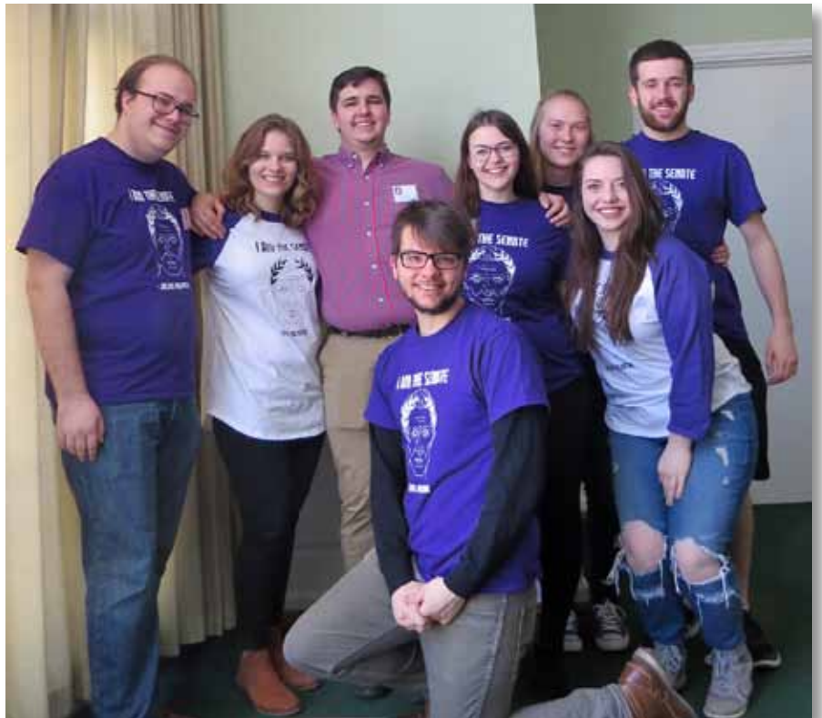
Delta Chi at St. Olaf College are eager to host the next convention