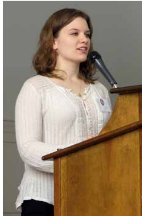
Chapter reports; above is Delta Chi at St. Olaf College