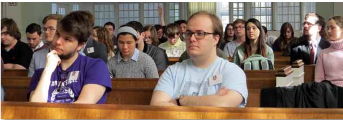
Delegates at the first business meeting