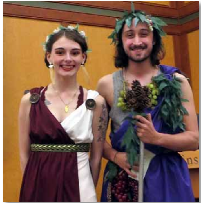
Best Dressed Femina Virque

T-shirt Regalia: Theta Omicron at Carthage College for "I'm such a Doric"