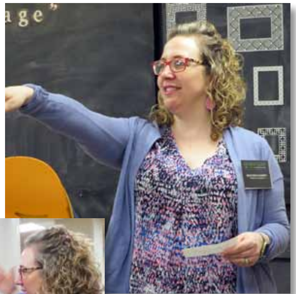
Below, it's a dagger