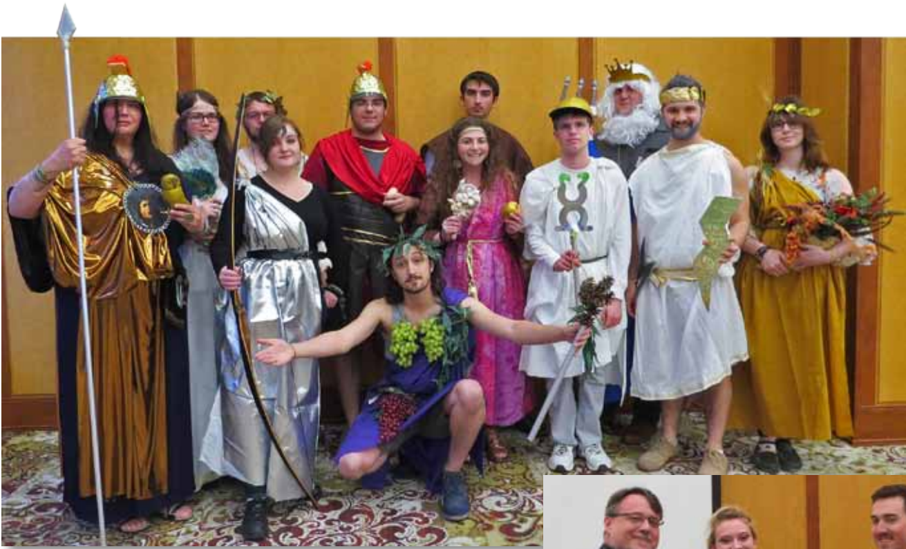
Above, the Twelve Olympians of Theta Tau at Stockton