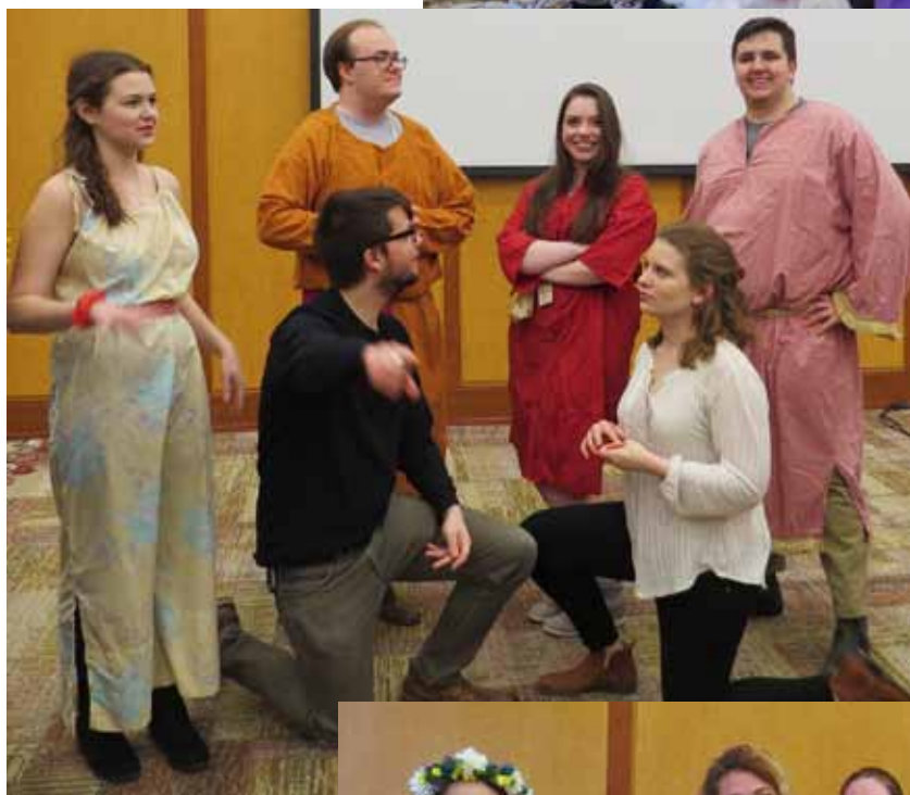
Below, Gamma Omicron at Monmouth College in their banquet regalia