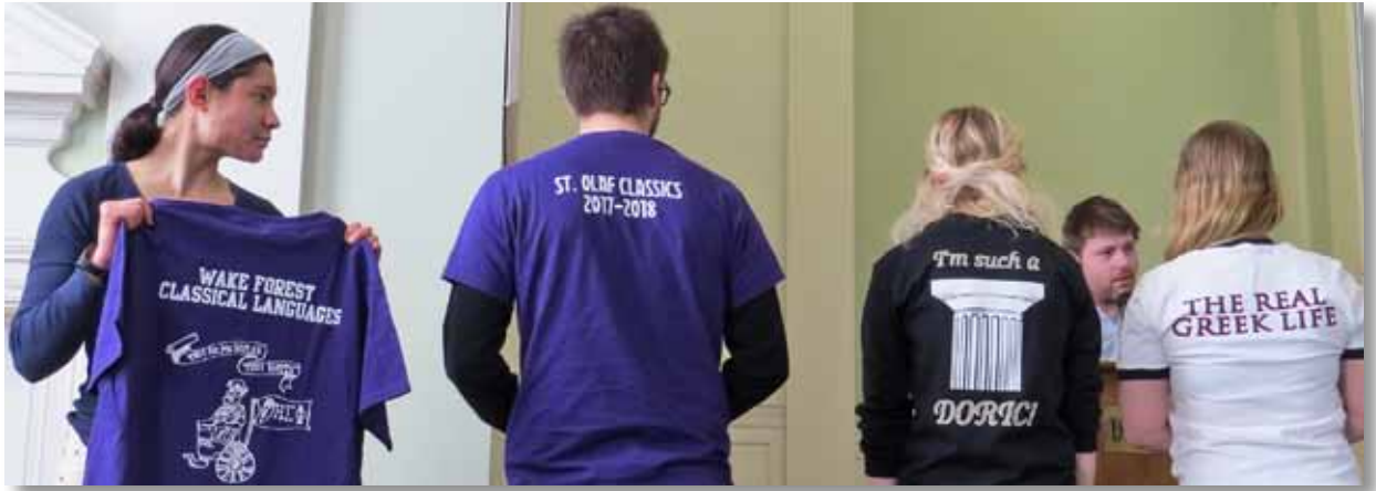
Above, T-shirt regalia