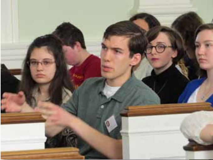
Left, questions from the audience