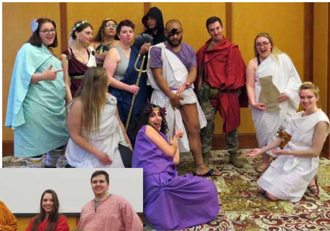
Above, the Twelve Olympians of Theta Omicron at Carthage College