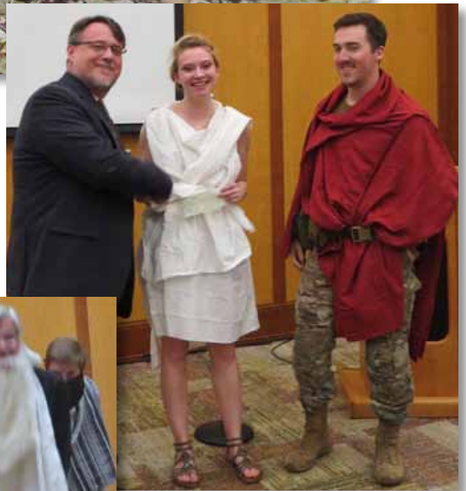
Below, the Red Devil Players take a bow after their smashing success with Lucians Philosophies for Sale