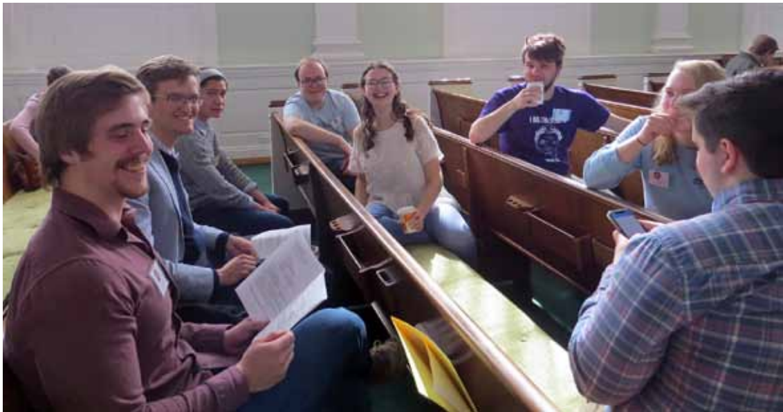
Fellowship between sessions