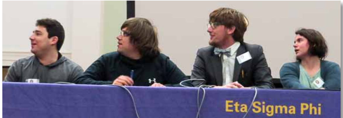
Epsilon at the University of Iowa