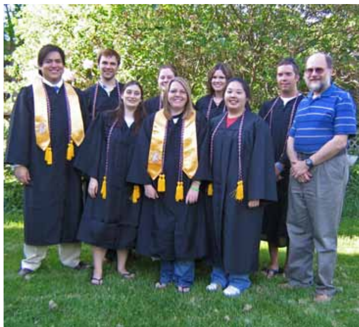
Members of the 2007 class of Gamma Omicron Chapter at Monmouth College wearing their Eta Sigma Phi cords and hoods.

Cords are $16 each by mail and $12 each if purchased at the national convention. Hoods are $21 each by mail and $17 each if purchased at the national convention.