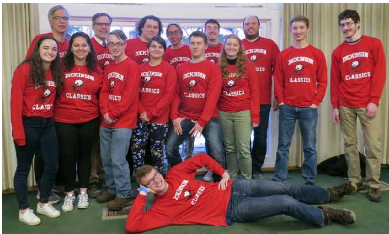
Delta Theta, our fabulous Red Devil Local Committee

BONUS 2. The Greek city-state Corinth was located at an isthmus that separated two Gulfs. What were they?