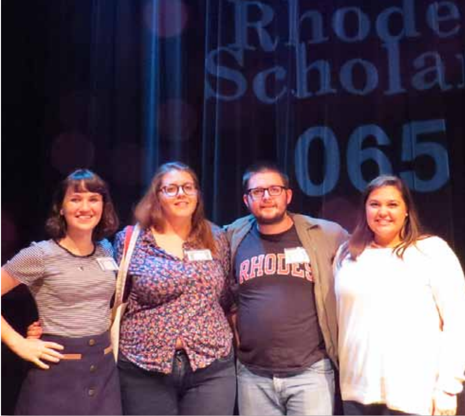
Victorious Rhodes Scholars

Bonus 2: The via Aurelia begins at Pisae. What city is at its other terminus?