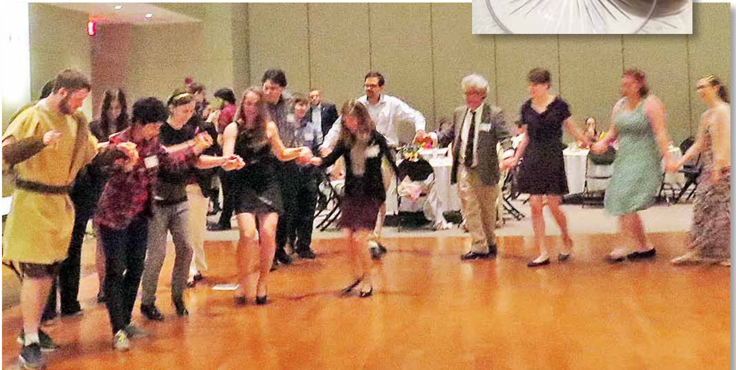
Greek Dancing Oompah