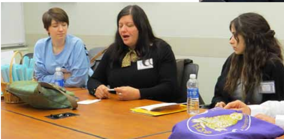
Convention Site Committee