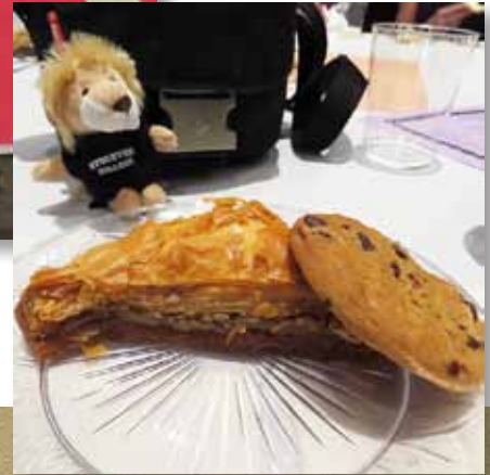
Baklava of epic proportions