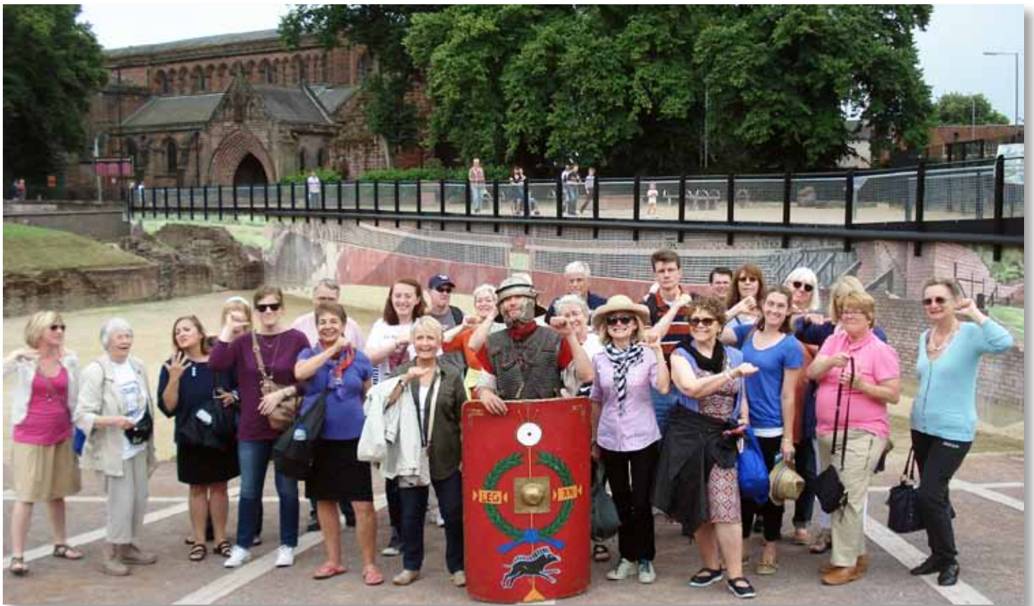
Beta Kappa—Chester group

Back in Baltimore in the fall we attended an interesting AIA lecture at the