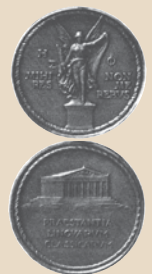
Obverse and reverse of the large silver medal

Eta Sigma Phi medals awarded to honor students in secondary school Latin classes help promote the study of Latin in high school and give Eta Sigma Phi an excellent contact with high school students of the Classics. Chapters can use them as prizes for contests or as a way to recognize