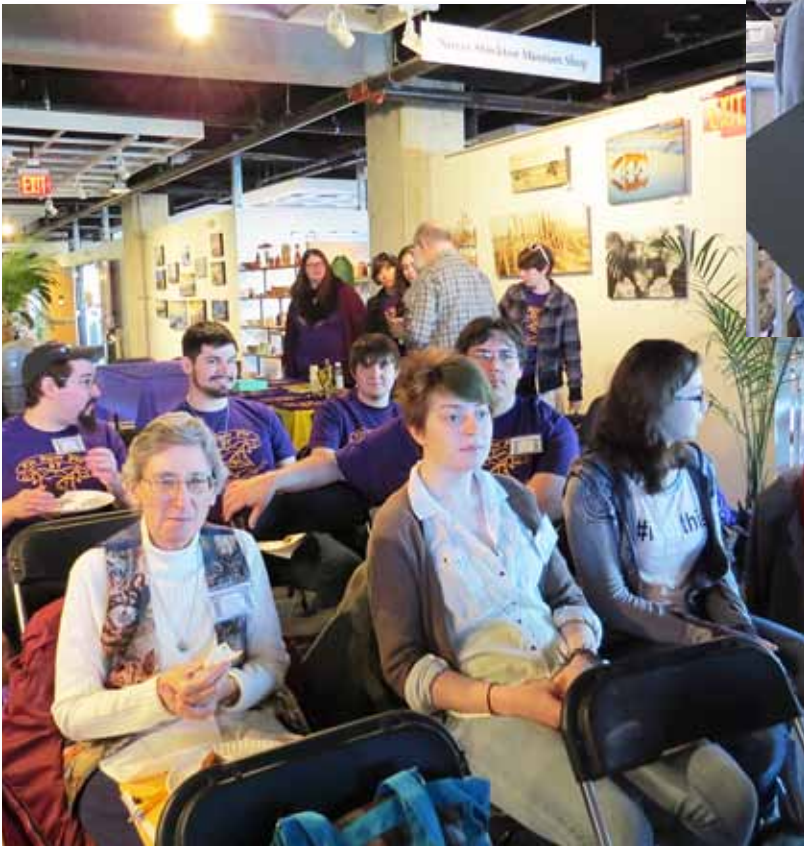
Below, Zeta Beta show off their regalia