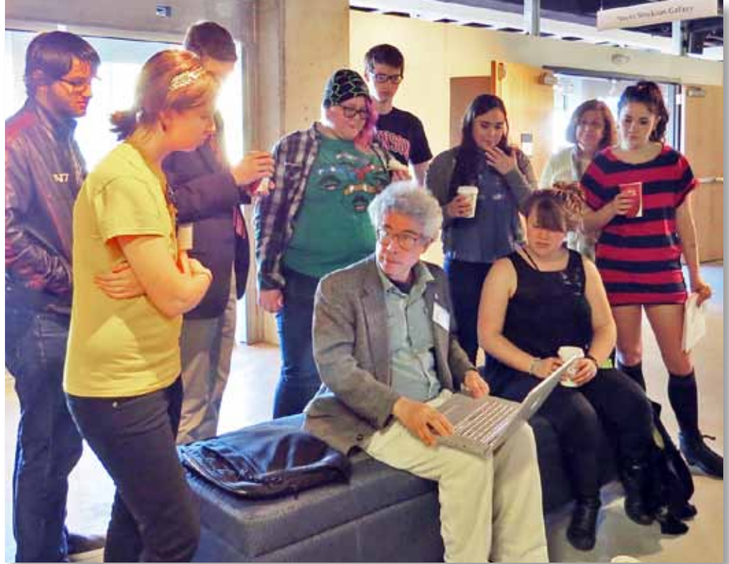
Resolutions Committee make their last-minute preparations