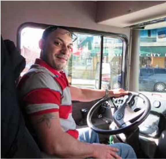
One of our trusty drivers who took us to Stockton, and a fighting Osprey