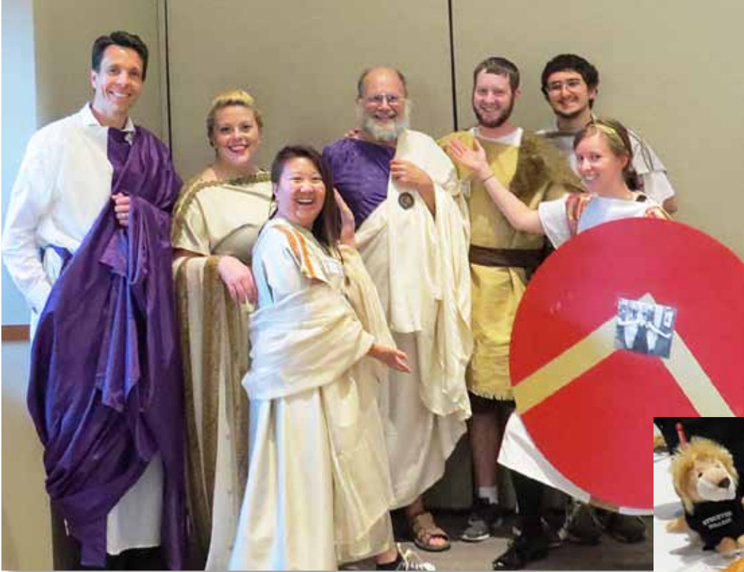
Gamma Omicron in their finery