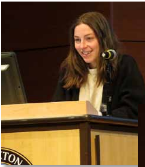
Delegates give chapter reports