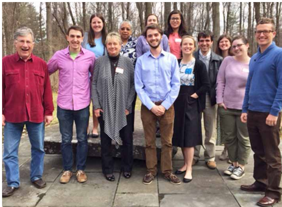
Zeta Theta Parilia

Eta Zeta hosted many events throughout the school year. We raised interest through events like our first annual Classics interest dinner party, several non-authentic Roman spaghetti dinners, a Lupercalentine's sale, various bake sales and Carpe Coffee, and Oktoberfest, where we sold hot cider. As a group, we visited and subsequently got lost in a corn maze, held a Saturnalia party (complete with a Secret Caesar exchange), symposia full of rollicking games and laughter, and played Who Killed Caesar: A Murder Mystery for Every Millennium . We also held several informal and spontaneous squirrel auguries—they just kept saying, "Six more weeks of winter!" Of course, we held our annual Homer-a-thon, both in English on the quad for the entire student body and an all-Greek one with professors and advanced Greek students. We provided weekly tutoring sessions for students in all levels of Greek and Latin, as well as weekly Latin instruction to local middle school students. Finally, we hosted our annual Greek and Italian dinners (this year, we had an Italian meets German, Gertalian, dinner in honor of our Advanced Latin class' study of Tacitus this semester). We love cooking both traditional and modern dishes to serve to our lovely faculty and to other Classics students, and it's always a great way to bond with each