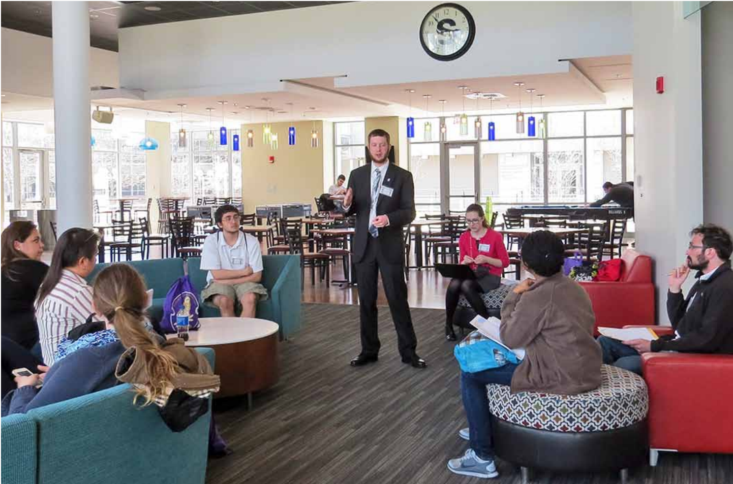
New Officer Committee