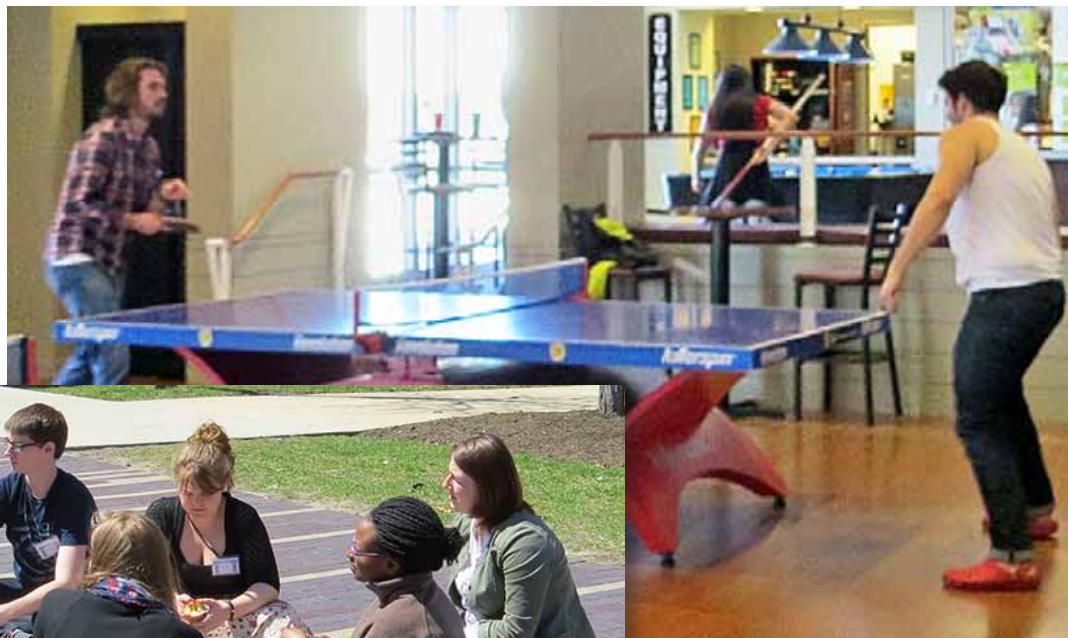
Relaxing during lunch