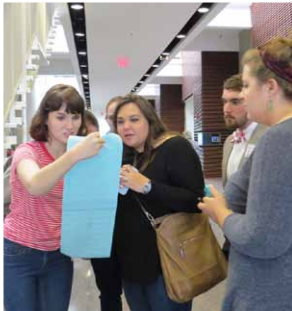
Scavenger hunt, start to finish