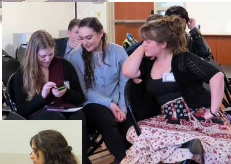
Resolutions Committee hard at work