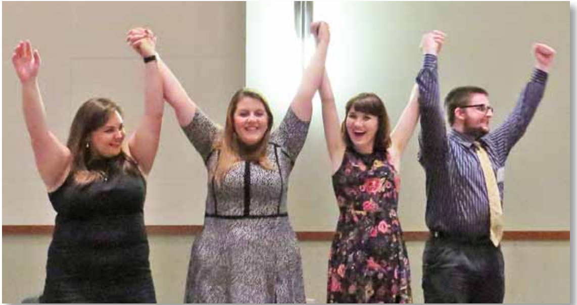
The Victorious Rhodes Scholars

Outreach: Delta Theta at Dickenson for the Lilikin Latin program