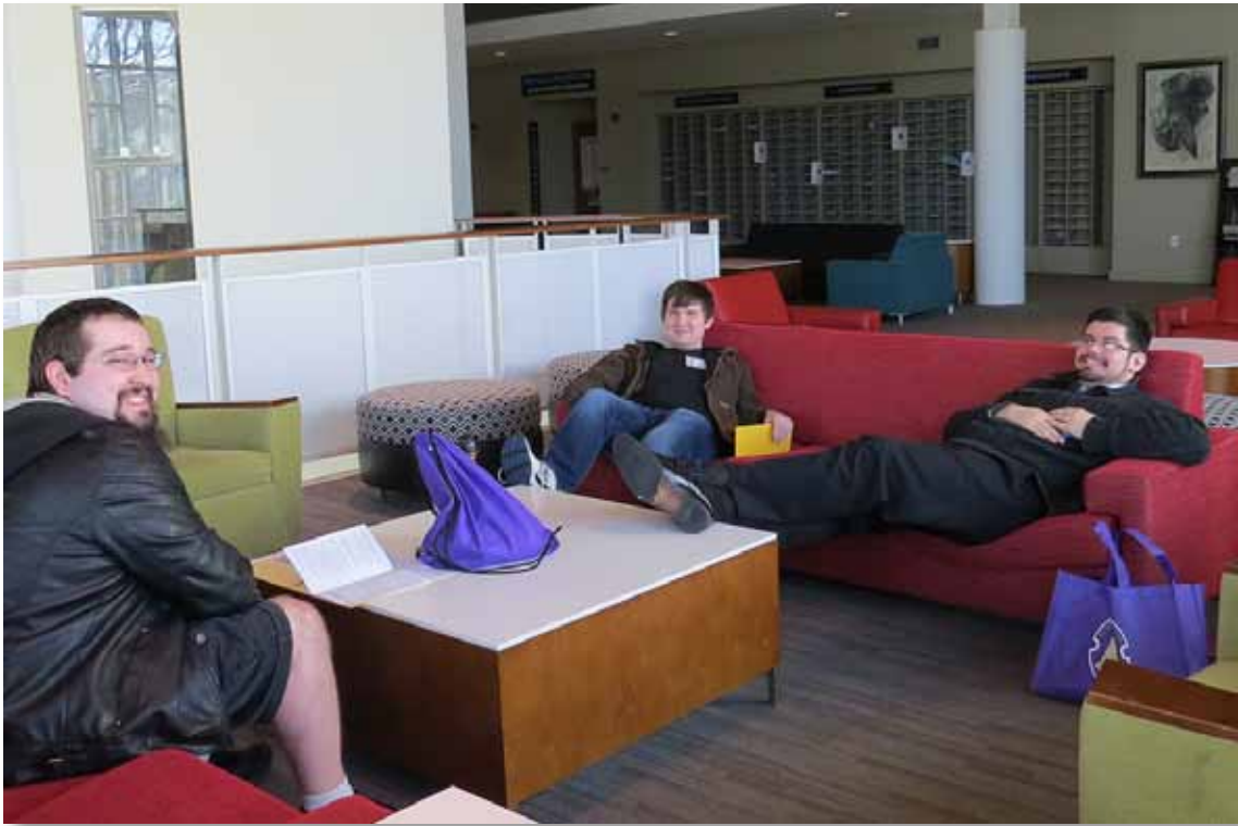
Local Committee taking a well-deserved break