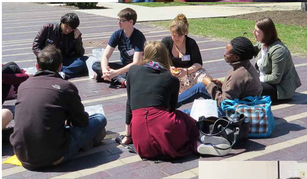
Lunch al fresco