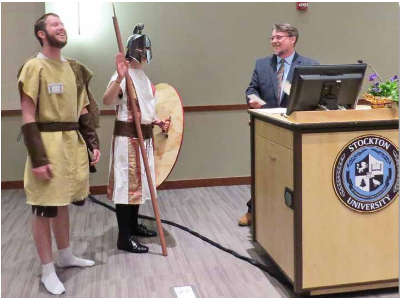
Best Dressed Delegates