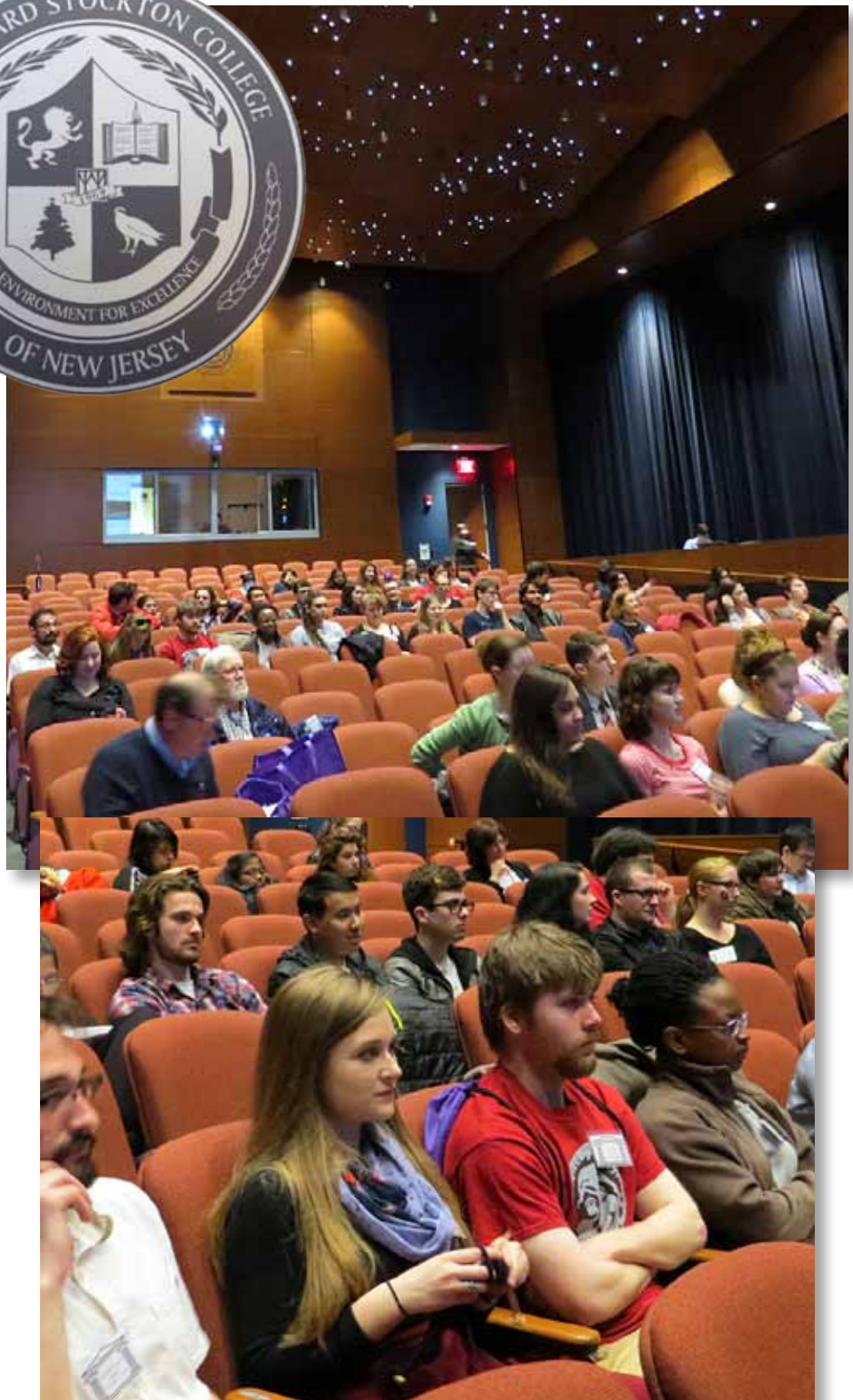
Delegates at Stockton University for Saturday sessions